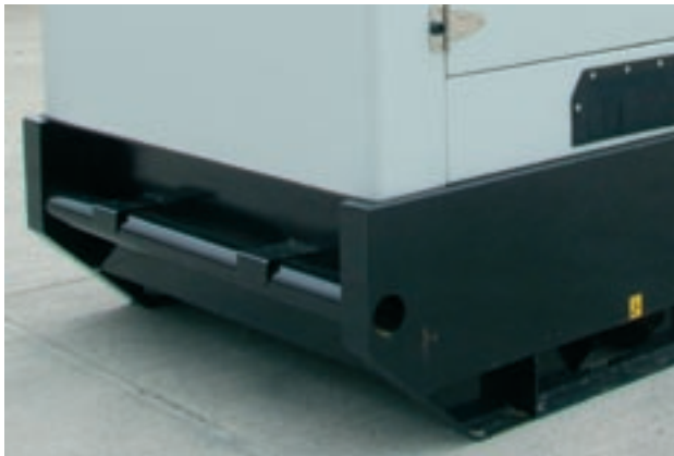
Heavy Duty Lift & Drag Points

The specifications for the Hire Ready Range are similar to the Professional Range with the following additional features: