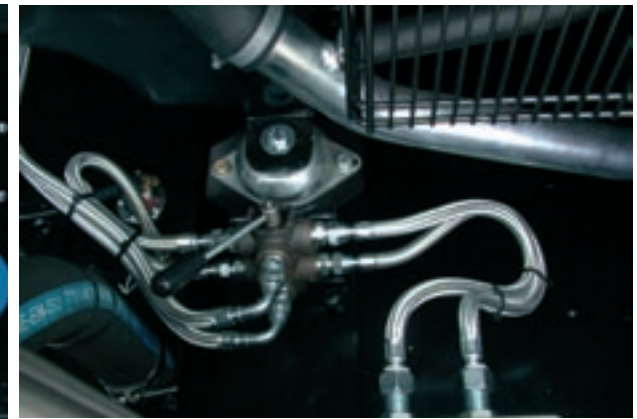
3-Way Bulk Tank Kit complete with external fuel connections