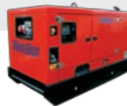
Model shown is the MPG40HR