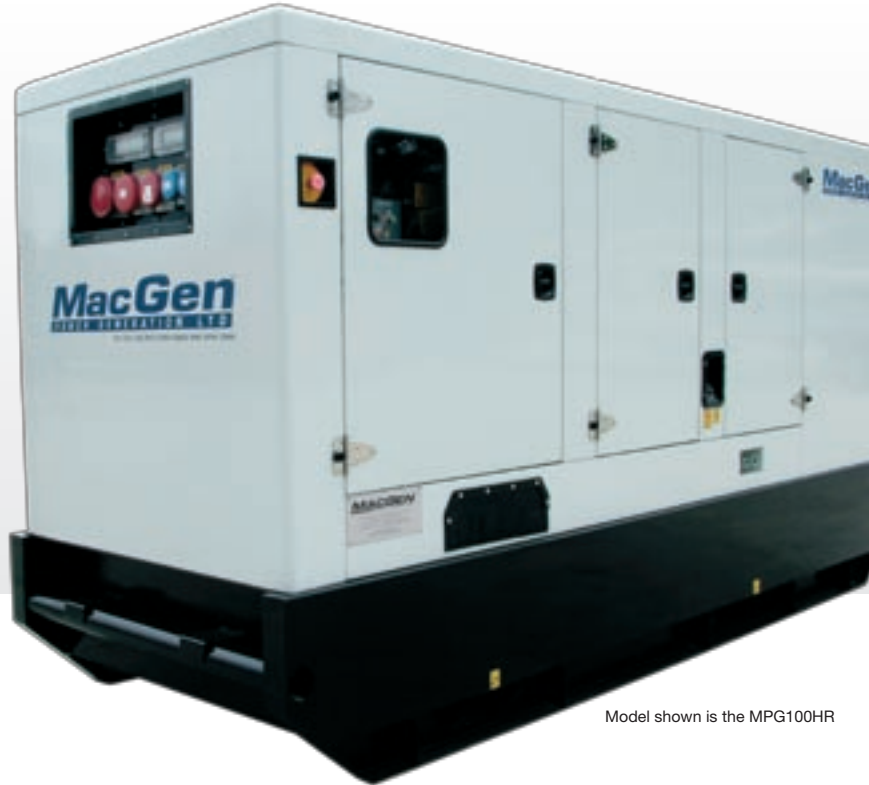
Model shown is the MPG100HR