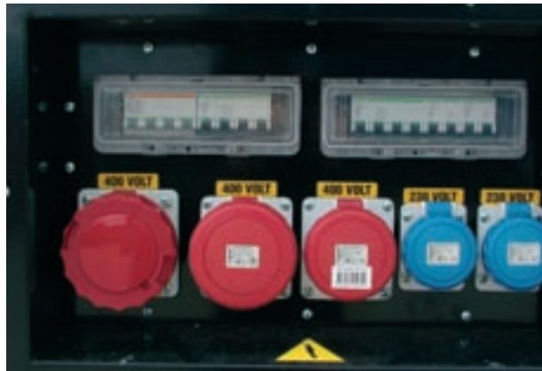
Distribution Box with individual breakers